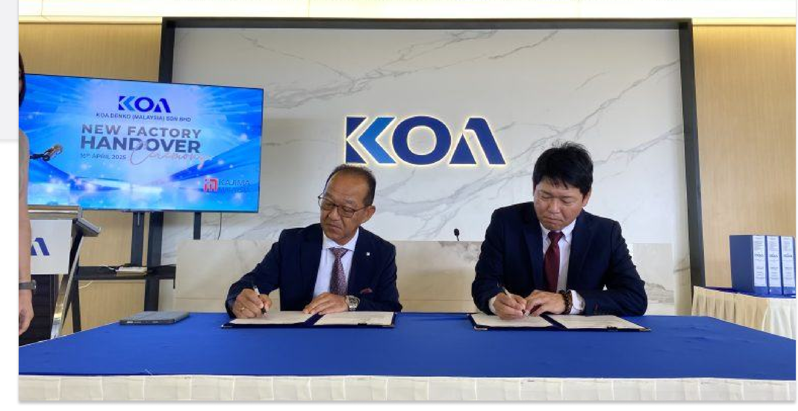
▲ At the handover ceremony: Representatives from Koa Denko (Malaysia) Sdn. Bhd. and Kajima (Malaysia) Sdn. Bhd., the construction contractor, sign the handover documents.

Thanks to the dedicated efforts of all parties involved, the construction was successfully completed, and the handover ceremony was held as scheduled. Plus PM Consultant remains committed to delivering optimal management services to realize our clients' visions and contribute to the creation of a sustainable society.